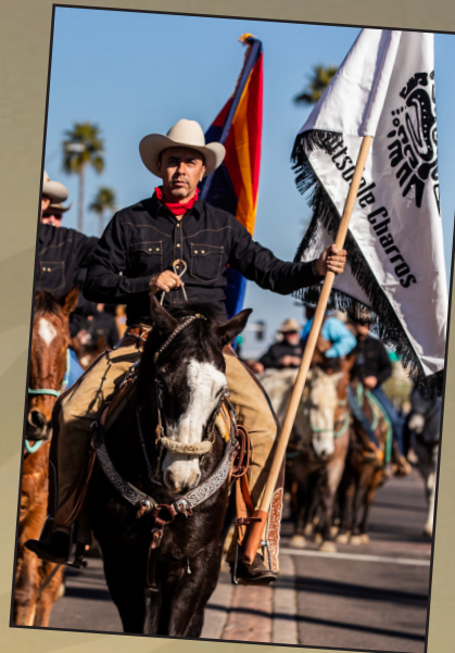
The 2022 Scottsdale Parada Del Sol celebration held, hosted and powered by the Scottsdale Charros promises a one-of-a-kind experience for everyone in the family.