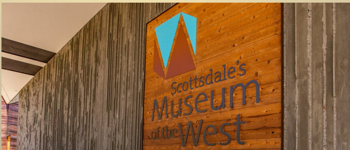
A view of the place where the iconic images, keepsakes and hidden treasures of the Old West can be found in Old Town Scottsdale.

As a result of a partnership with Arizona Highways, the museum recently displayed an exhibition titled The Art of Our Photography, which featured the work of 10 artists that were given access to the magazine's extensive photo archive and invited to select any of the images Arizona Highways has published since 1925 to recreate through their artistic craft. For more information about Western Spirit: Scottsdale's Museum of the West: www.scottsdalemuseumwest.org .